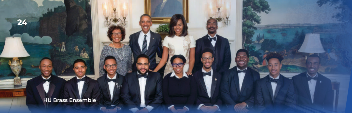
HU Brass Ensemble