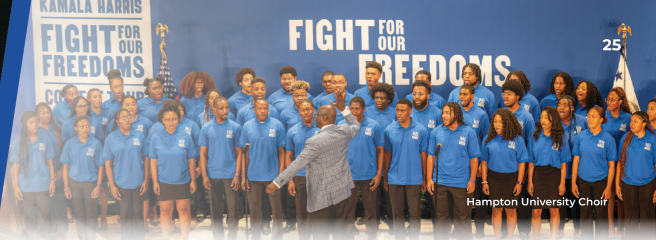
Hampton University Choir