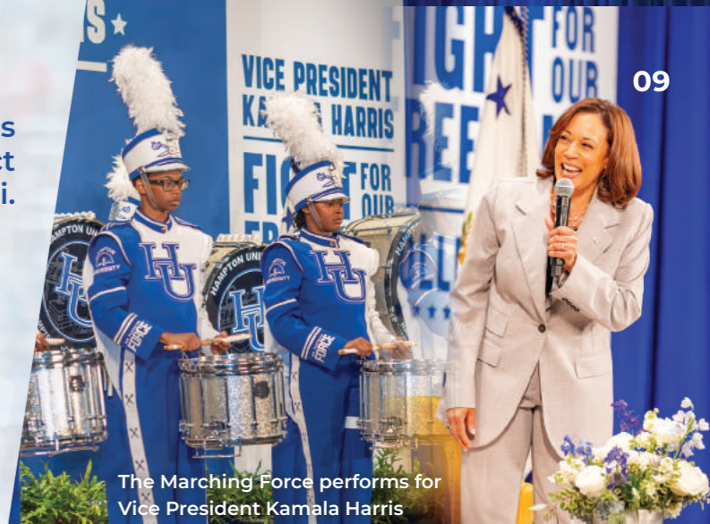
The Marching Force performs for Vice President Kamala Harris

The Pell Grant Award is $7,395 per academic year as of Fall 2023.