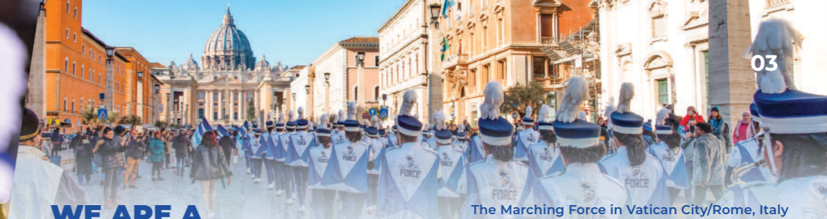
The Marching Force in Vatican City/Rome, Italy

performance at the Honda Battle of the Bands in Atlanta, GA—followed by another invite to the Honda in 2020. In 2019, our Drumline performed in the Tournament of Roses Parade in Pasadena, CA. Also in 2020, the band flew to Rome, Italy, to perform in the New Year's Day Parade and Celebration. Most recently, the band was seen in the 2021 Macy's Thanksgiving Day Parade in New York City. In The Hampton University Marching Force, we believe in giving our students the opportunity to travel, see the world, and experience different cultures through music, because it is through music that we are all connected!